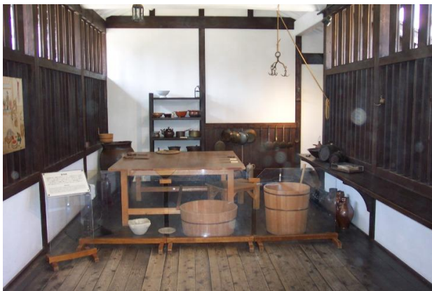
Reconstruction of kitchen at Deshima open air museum, Nagasaki

Jan Cock Blomhoff (1779-1853) succeeded Hendrik Doeff as director ( opperhoofd ) of the Dutch trading post ( factorij ) at Deshima in the harbor of Nagasaki, Japan in December 1817 and served there until 1823.