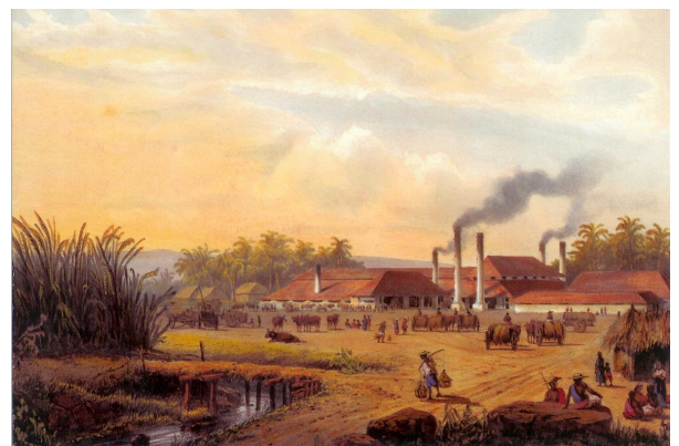
Sugar Manufactory Pangka, Tegal, Java by A. Salm, c. 1872, collection of the KITLV, Leiden, The Netherlands, 47D-4 (the illustration is not part of the microfiche collection)

In the early 1830s the Dutch introduced the "cultuurstelsel" (cultivation system) into their East Indies colony of Java. This system amounted to forcing the native Indonesians to cultivate various cash crops, in particular sugar and coffee, to be paid to the colonial government, which would then sell them on the world market through the Dutch Trading Company ( Nederlandsch handelmaatschappij ) set up in 1824 under royal patronage. By 1840 the first famines provoked by increased exploitation were reported. By mid-century the system had brought great wealth to the colonial power, but was coming under more and more criticism both in Indonesia and the Netherlands. By the 1850s circumstances led the minister of the Colonies to order an extensive investigation into the system of (text continued on reverse)